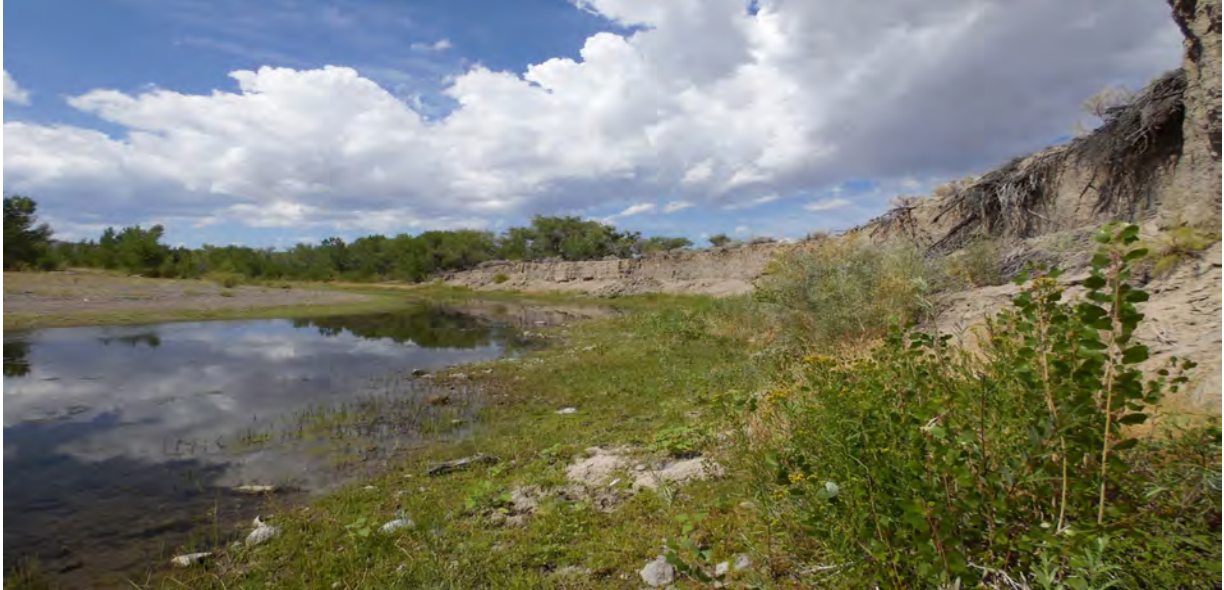
MCR 049 and visible bank erosion

The Dayton Valley Conservation District has received funding to perform critical repair projects along the Middle Carson River. These projects are Middle Carson River 048 (along the Minor Ranch Property) and Middle Carson River 049 (along Fort Churchill Road and Buckland Ditch). The projects aim to restore eroding river bank and prevent future damage to infrastructure in the area. Emergency repairs were conducted in February, 2017 to stabilize the project on the Minor Ranch, which had severely eroded. The repairs were completed prior to the February flood, and appear to have held up well during that flood event, as well as during the spring runoff. The project along Fort Churchill Road is a large and expensive project. The project is planned for completion in the fall of 2017. RO Anderson Engineering recently conducted surveys of both project sites to determine the degree of damage caused by the January and February floods, as well as the prolonged spring runoff. Currently budgets and priorities are being evaluated to determine if one or both projects will be completed in 2017, or if some funds might be averted to more critical places damaged by the flood. The district is grateful for a variety of funding sources to complete the project: Nevada Department of Environmental Protection 319h program, Carson Water Subconservancy District, Lyon County, Nevada Division of State Parks, Nevada Department of Water Resources and RO Anderson Engineering.