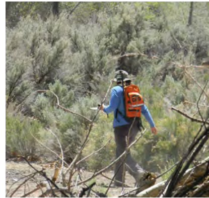
Crew mapping and spraying treatment areas

DVCD was also able to work with Storey County on noxious weed treatments and inventory. District crews have seen significantly diminished infestations of noxious weeds in 6 and 7 Mile Canyons, Gold Hill, and Virginia City because of annual treatments.