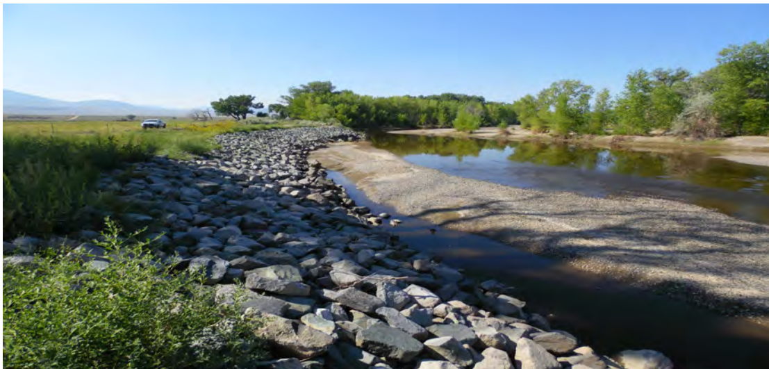
MCR 048 Emergency Repair Work

The Dayton Valley Conservation District has received funding to perform critical repair projects along the Middle Carson River. These projects are Middle Carson River 048 (along the Minor Ranch Property) and Middle Carson River 049 (along Fort Churchill Road and Buckland Ditch). The projects aim to restore eroding river bank and prevent future damage to infrastructure in the area. Emergency repairs were conducted in February, 2017 to stabilize the project on the Minor Ranch, which had severely eroded. The repairs were completed prior to the February flood, and appear to have held up well during that flood event, as well as during the spring runoff. The project along Fort Churchill Road is a large and expensive project. The project is planned for completion in the fall of 2017. RO Anderson Engineering recently conducted surveys of both project sites to determine the degree of damage caused by the January and February floods, as well as the prolonged spring runoff. Currently budgets and priorities are being evaluated to determine if one or both projects will be completed in 2017, or if some funds might be averted to more critical places damaged by the flood. The district is grateful for a variety of funding sources to complete the project: Nevada Department of Environmental Protection 319h program, Carson Water Subconservancy District, Lyon County, Nevada Division of State Parks, Nevada Department of Water Resources and RO Anderson Engineering.